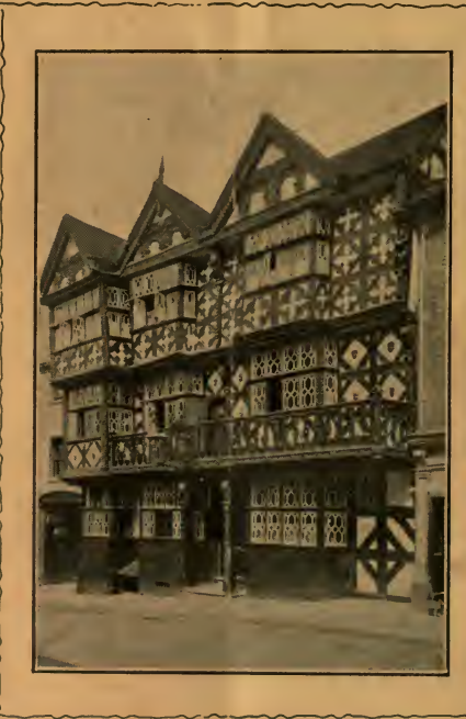
Table d'Hot at 7-30 each evenir